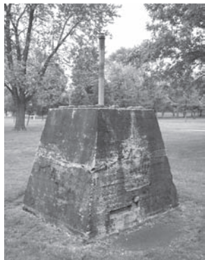
The last surviving piece of the old amusement park. A 1927 photo reveals the ride it held.

Paul brought a number of incredible photos of the old amusement park. We copied these digitally to preserve them. They had been taken from the top of the roller coaster and show many of the rides and attractions in amazing detail.