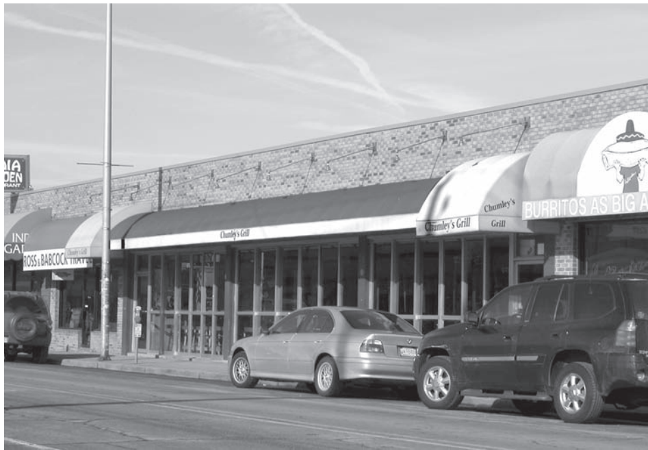
Chumley's is between La Bamba and India Garden on Broad Ripple Avenue.

Chumley's is a popular watering hole on the strip, well-known for its extensive beer selection, pool tables and warm weather patio seating along the street. They've been in Broad Ripple for six years - a second location in Lafayette has been open for three.