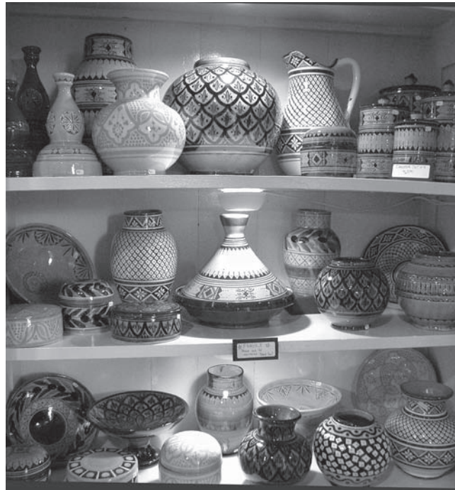
Ornate pottery in every shape at Happy Trails Studio.