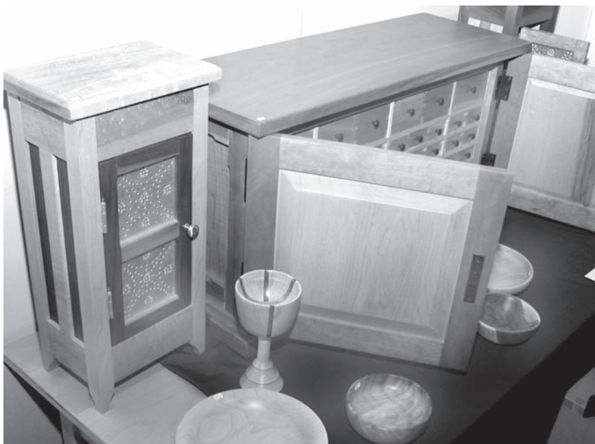
A small sampling of the fine woodworking on exhibit at Happy Trails Studio by the Women's Woodworking Guild of Indiana.