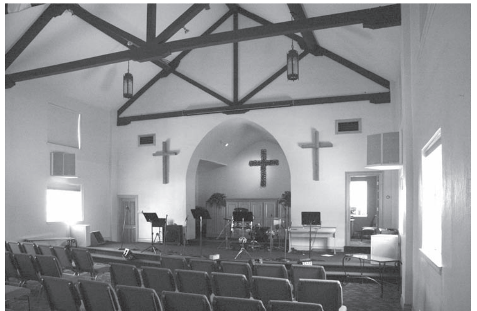
The interior of the church at 62nd and Carrollton Avenue.

If you are interested in helping Broad Ripple develop a small theater group, contact Van Kirby at (317) 490-9550.